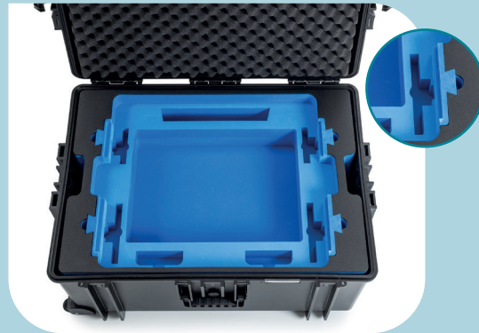
Standard V4 (bottom insert)