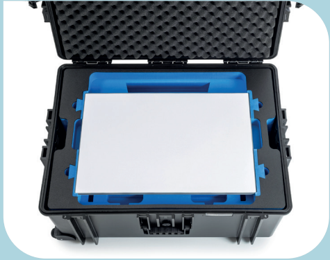
Enterprise (bottom insert)